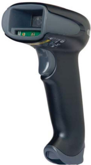
From HD linear barcodes to 2D barcodes displayed on a smartphone screen, this tough area-imager scans virtually all barcodes with ease.

Featuring a custom sensor that is optimized for barcode scanning, the Xenon™ 1900g scanner offers industry-leading performance and reliability for a wide variety of applications that require the versatility of area-imaging technology. Powered by sixth-generation Adaptus™ imaging technology, the Xenon 1900g scanner delivers superior barcode scanning and digital image capture. The scanner incorporates a revolutionary decoding architecture and a custom sensor, enabling extended depth of field, faster reading and improved scanning performance on poor-quality barcodes. From high-density linear to 2D barcodes found directly on the screen of a mobile device, the Xenon 1900g scanner decodes virtually all barcodes with ease. A new space-saving design that mounts critical components on a single board eliminates the need for connectors. A more reliable design with fewer components minimizes downtime and improves serviceability, resulting in increased productivity. Its small form factor ensures that the Xenon 1900g scanner fits well in virtually any-sized hand, reducing operator fatigue. Built with durability in mind, the Xenon 1900g scanner can withstand up to 50 drops to concrete from distances as high as 1.8 meters (6 feet). An IP41-rating provides added protection. With a solid-state design backed by a five-year warranty, the Xenon 1900g scanner is constructed to deliver years of uninterrupted performance.